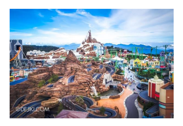
Day 4: GENTING HIGHLAND TO SINGAPORE HOTEL (B/L)

After Breakfast, Check out from Genting Hotel & Proceed to Singapore