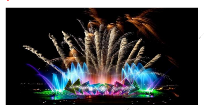
Day: 6 – Full day Sentosa (cable car + WOT + Sea aquarium+Madam tussauds (5 in 1)+01 Lunch at Sentosa (Good& old days)+ Night safari with ULLu ULLU dinner)

After Breakfast, We will visit to Sentosa Island. Overnight Stay at Hotel.